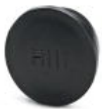
Plastic dust protection cap, anti-static, for RF, SF series connectors, with M23 external thread

Plastic anti-static dust protection cap - RC-Z2469 - 1611797