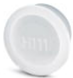
Plastic dust protection cap for connectors with M23 knurled nuts

Plastic dust protection cap - RC-Z2058 - 1604223